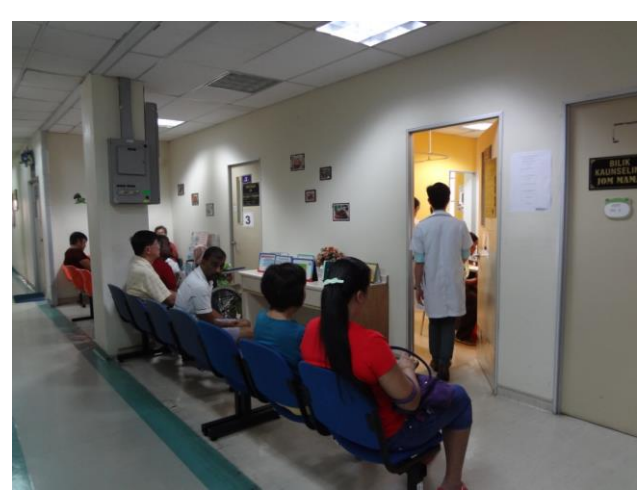
Clinic for diabetes and hypertension