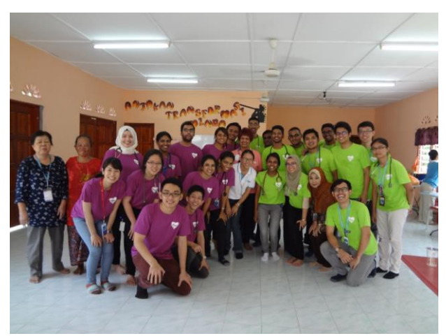
IMU Care Project